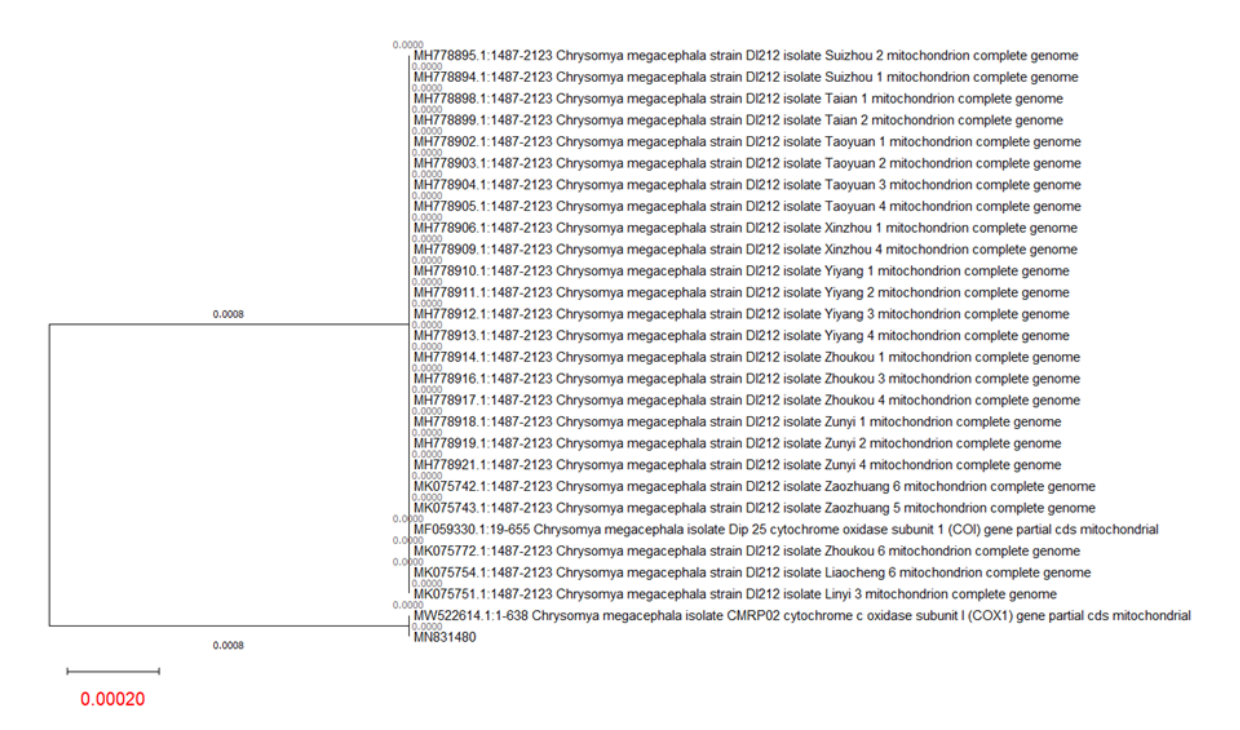
Fig. 2 Evolutionary analysis of SR1859-COI-F E03 Chrysomya megacephala by Maximum Likelihood method