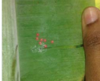
Plate 1a. Eggs of Erionota torus