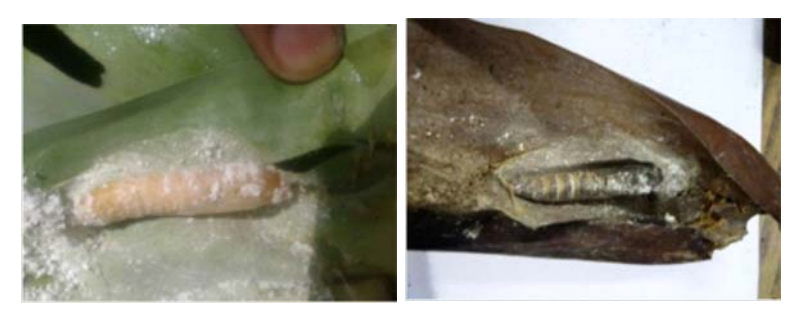
Plate 2a. V instar larva under pupation

50.01 per cent during winter and gradually decreased to 31.05 per cent during summer season (Study area B) due to high temperature which affected the larval lifespan.