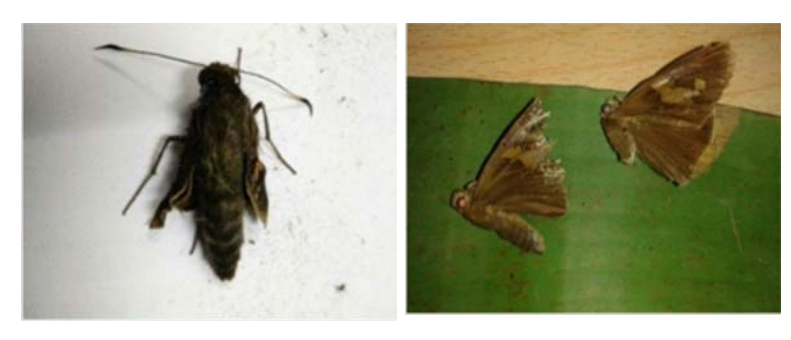
Plate 2c. Adult after emergence