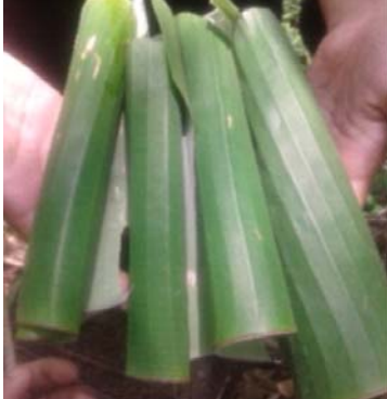
Fig. 3 Banana - leaf rolls