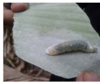
Plate 1d. III instar larvae of E. torus