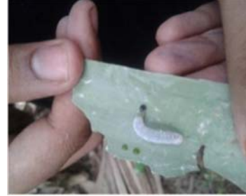
Plate 1b. I instar larvae of E. torus