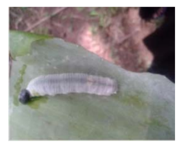
Plate 1e. IV instar larvae of E. torus