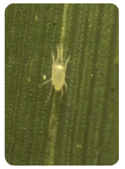
Plate 3. Adult male of O.oryzae

stage between larva and protonymph. During this stage, larva stopped feeding, remained attached to leaf surface and entered into quiescence, with the anterior two pairs of legs kept forward and close towards the body and the posterior legs were extended backwards and held close to the sides of opisthosoma. This stage was immediately followed by moulting. Average duration of nymphochrysalis stage was 0.73 days for male and 1.03 days for female (Table 1)