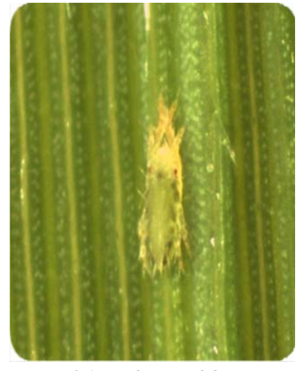
Plate 4. Adult female of O.oryzae

Deutonymph was the second nymphal stage and emerged from deutochrysalis after moulting. They were actively moving and feeding. Deutonymph was